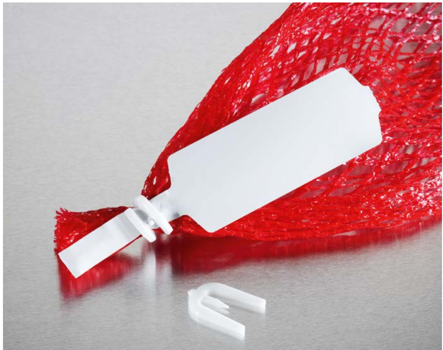
Patented plastic clip for secure closure of netting with DCD P 600 N