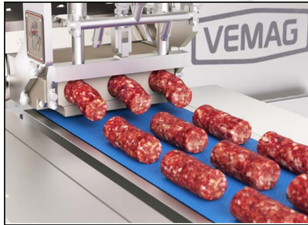
3-track filling flow divider FST883

The flow of product discharged from a filling machine inevitably leads to problems in filling at accurate weights if this flow has to be divided up into different filling flows for subsequent processing. The VEMAG filling flow divider FST883 solves this problem. Completely identical filling flows under all production conditions guarantee filling at accurate weights and thus extremely consistent product quality.